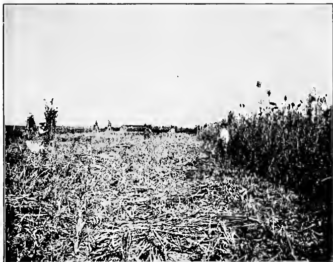
COLONISTS HARVESTING KAFIR CORN.